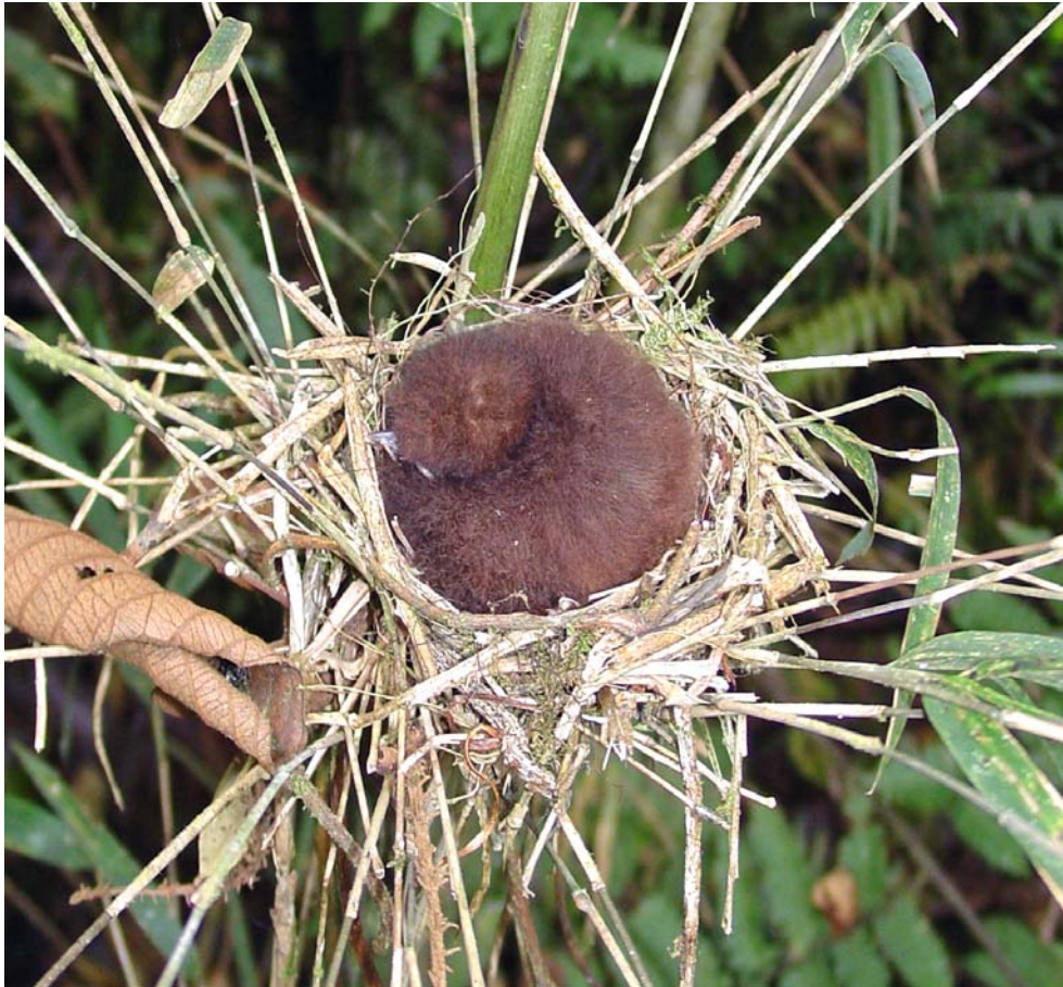
FIG. 1. Nest of Slate-crowned Antpitta ( Grallaricula nana ) with an older nestling, 4 days prior to fledging. November 2006, Yanayacu Biological Station, Napo, Ecuador.

weighed each category separately. In addition to those nests described above, we provide nest site characteristics for two inactive nests found at Tapichalaca.