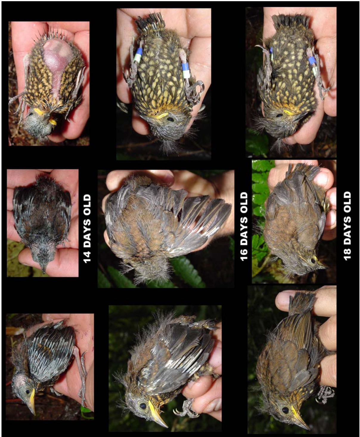
Figure 4. Nestlings of Spotted Barbtail ( Premnoplex brunnescens ), 14 to 18 days old, at the Yanayacu Biological Station, Cosanga, Ecuador.