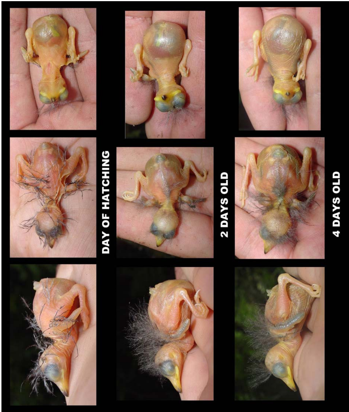
Figure 2. Nestlings of Spotted Barbtail ( Premnoplex brunnescens ), hatching to 4 days old, at the Yanayacu Biological Station, Cosanga, Ecuador.