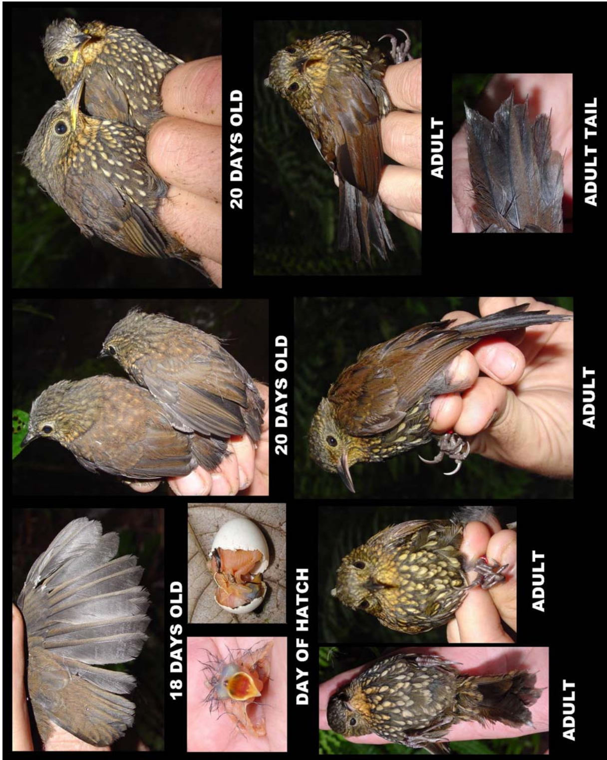
Figure 5. Photographs of adults and nestlings of Spotted Barbtail ( Premnoplex brunnescens ) at the Yanayacu Biological Station, Cosanga, Ecuador.