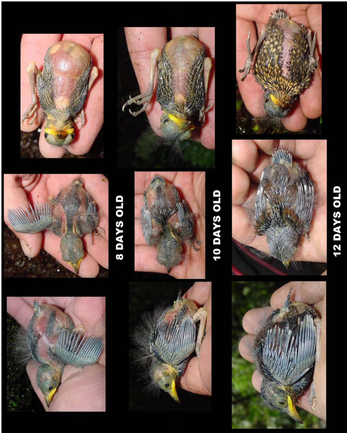
Figure 3. Nestlings of Spotted Barbtail ( Premnoplex brunnescens ), 8 to 12 days old, at the Yanayacu Biological Station, Cosanga, Ecuador.