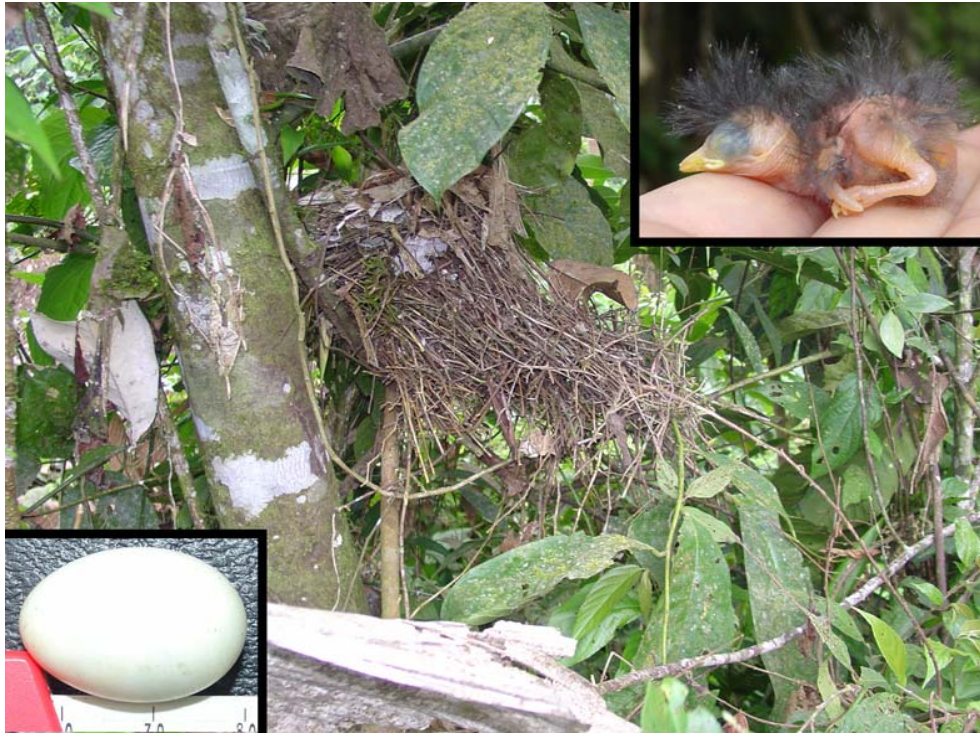
FIG. 1. A nest of Dusky Spinetail ( Synallaxis moesta ) in northeastern Ecuador. Upper right inset shows a recently hatched nestling and lower left inset the all-white egg.

returned to collect the nest. At this time the nest appeared intact, but all of the snake skin had been removed. I brought the nest indoors and allowed it to dry for 3 months before taking it apart to examine and weigh its components.