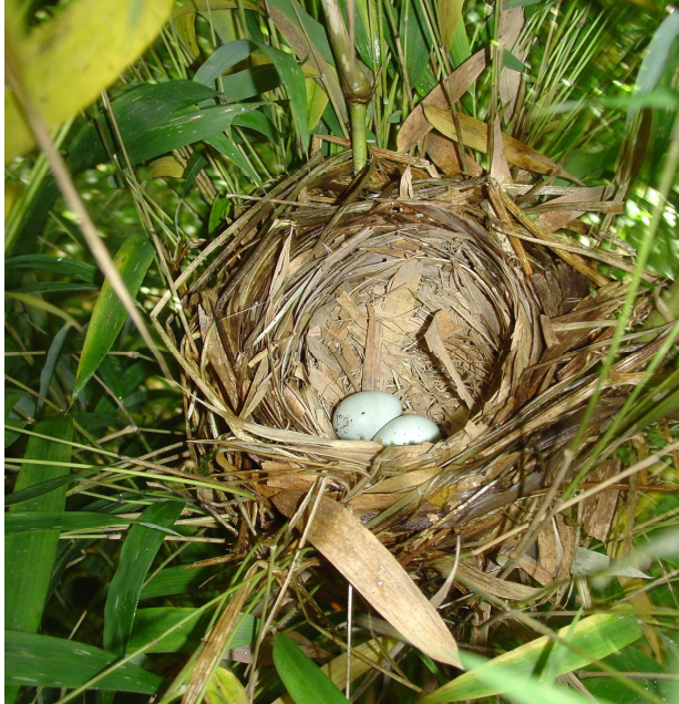
Figure 1. Nest and eggs of the Yellow-billed Cacique ( Amblycercus holosericeus ) found in December 2006 at the Yanayacu Biological Station, northeastern Ecuador.

(mean \pm SD = 40.7 \pm 24.5 min). The duration of absences from the nest ranged from 0.3 to 65.1 min (mean \pm SD = 24.4 \pm 15.1 min). On three occasions, the adult was absent for less than 1 min and, as presumably only one adult is attending the eggs (Skutch 1954), we feel these short absences may represent instances of the attending adult foraging on insects spotted from the nest, something we have observed in other incubating passerines in the area (e.g., Greeney 2006).