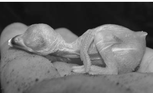
Figure 3. Nestling Masked Trogon Trogon personatus on day of hatching, Yanayacu Biological Station, Napo, Ecuador (Harold F. Greeney)

temperature data logger are shown in Fig. 2, and are generally similar to those described for other trogons. Incubation at one nest, from laying of the first egg until the hatching of the first nestling, was 18 days.